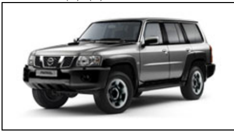
Gun Metal (M)