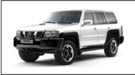
Alabaster (S) (S)