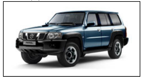
Orbital Blue (M)