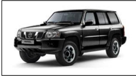
Kuro Black (S) (S)