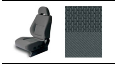
Cloth upholstery (Grey)