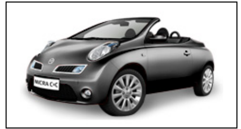
Techno Grey (M)