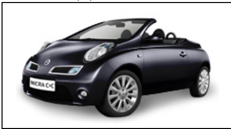
Nero Black (M)