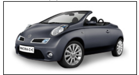
Faded Denim (M)