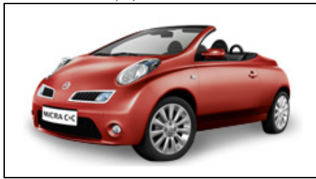
Emotion Red (M)