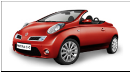
Flame Red (S)