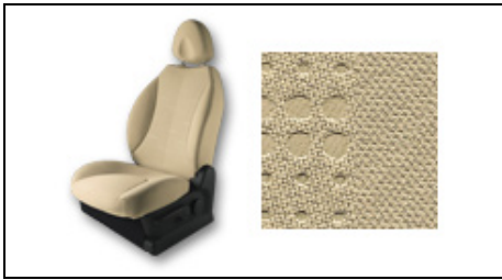
Beige / Chocolate