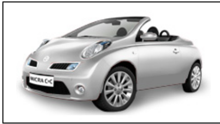
Blade Silver (M)