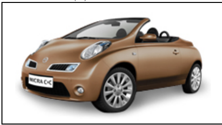
Caffe Latte (M)