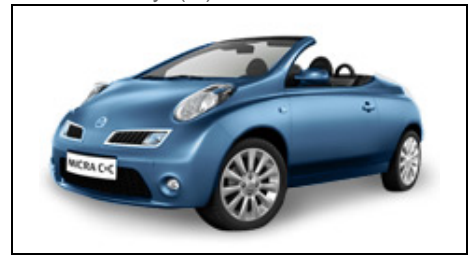
Pacific Blue (M)