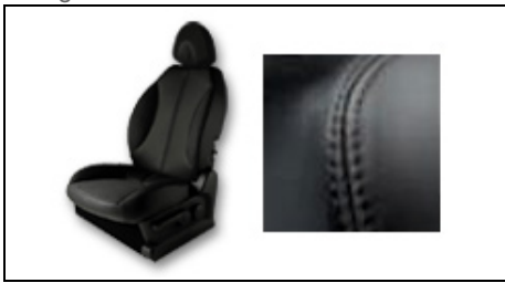
Graphite Part Leather