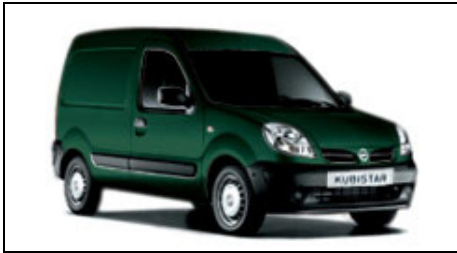
Pine Green (M)