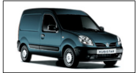
Baltic Blue (S)