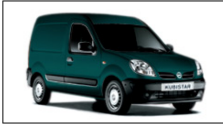
Forest Green (S)