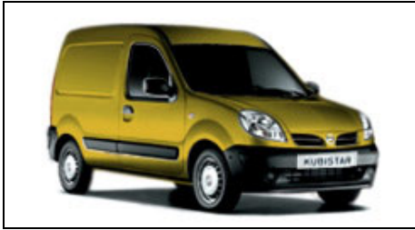
Citrus Yellow (M)