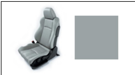
Frost Grey Leather