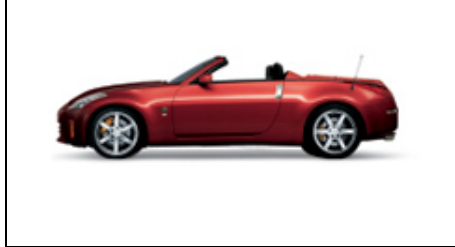
Rosso Red (S)