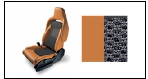
Alezan Orange Leather ventilated net seats, with gearshift and handbrake