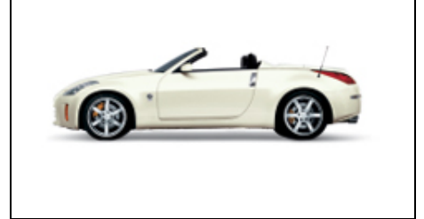
Pearl White (P)