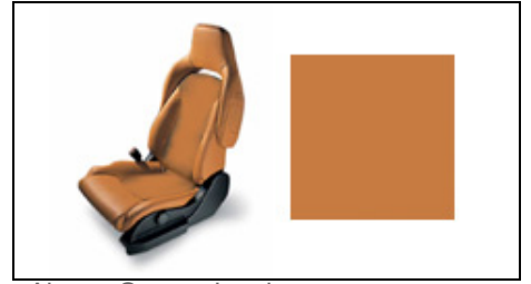
Alezan Orange Leather