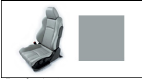
Frost Grey Leather